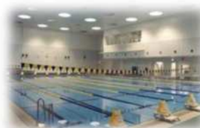
Abeno indoor pool