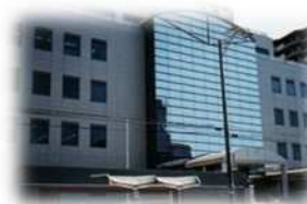
Miyakojima Sports Center