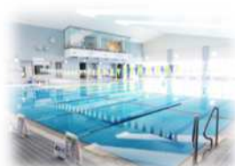
Nishi indoor pool