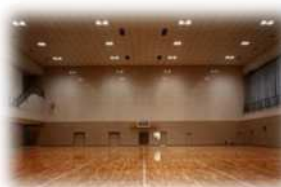
Asahi Sports Center