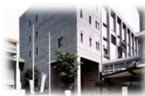
Fukushima Sports Center