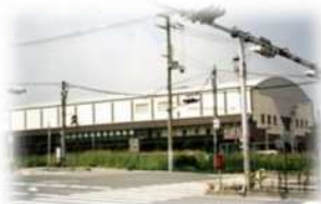
Higashi Sumiyoshi Sports Center